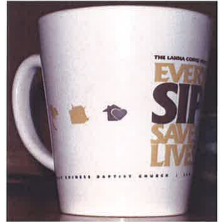
Lanna Coffee Mug