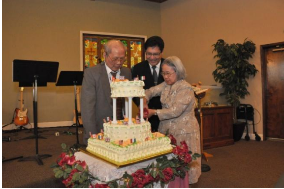
New Life Christian Fellowship, Castro Valley CA