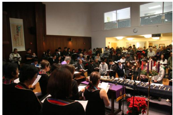
Advent worship service