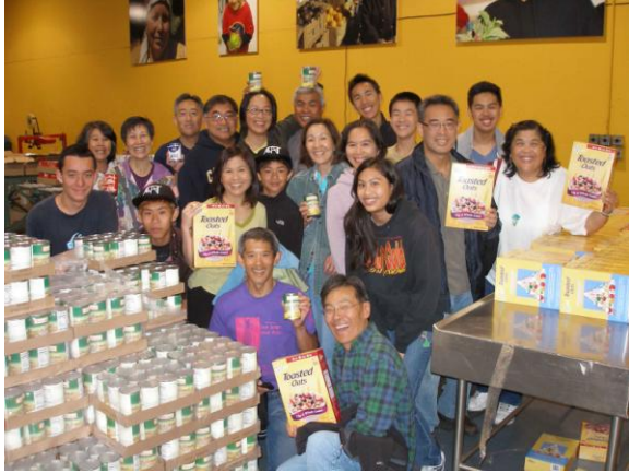
At the Food Bank