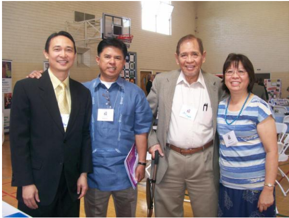
Above and below: Asian Ministries meeting in Los Angeles in April, with time for a meeting of the Asian Caucus