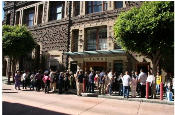
Outside church after serviv