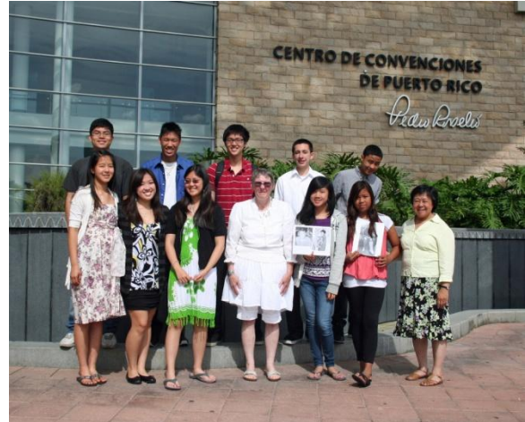
Chinese Christian Church and Center, Philadelphia PA